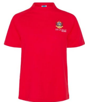
St Mark's House