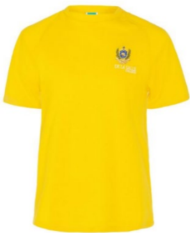
St Austin's House