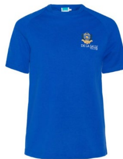
St Leo's House