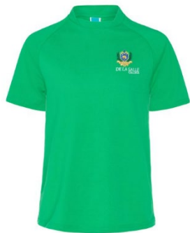
St Edwin's House